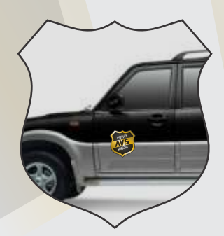
Valuables Escorting Services