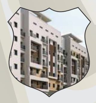
Residential Guarding Services