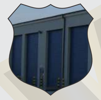
Industrial Guarding Services